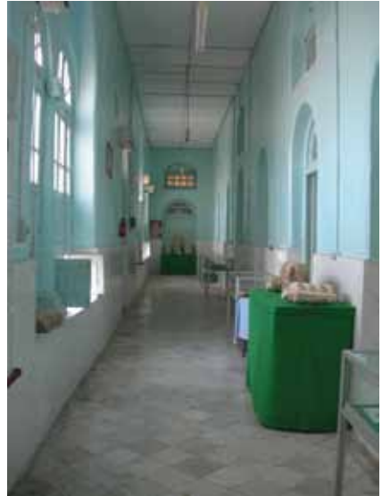
Figs. 2-4 - Museum main exhibition room and corridors

A third room displays a smaller collection of Islamic antiquities. At the upper floor, the museum also hosts "The Ethnographic Museum".