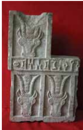
Fig. 14 Inscribed block with bucrania in relief