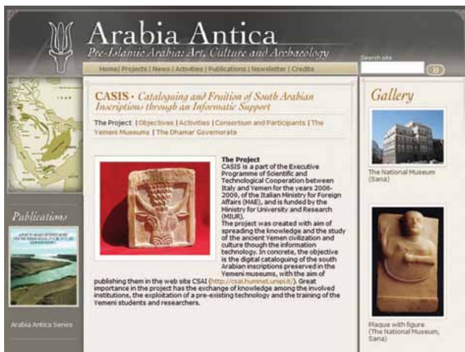
Fig. 26 - Home page of CASIS on Arabia Antica ( http://arabiantica.humnet.unipi.it )

In the project, the University of Pisa cooperates with GOAM (Ministry of Culture) and the Universities of Sana, Dhamar and Aden (Ministry of Higher Education and Research). The computerrelated part of the project is conducted by the SIGNUM Computer Research Centre of the Pisa Scuola Normale Superiore.