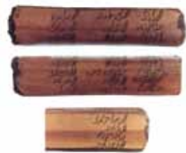
Fig. 12 Texts on wooden sticks