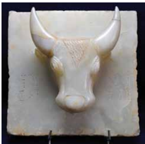
Fig. 30 Stela with bull head in relief