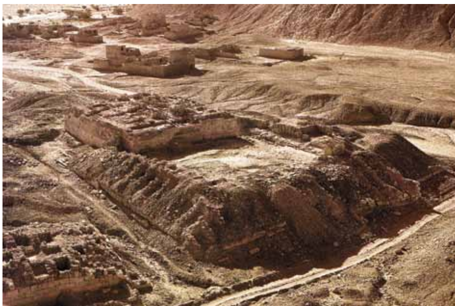
Fig. 9 - Shabwa (Hadramawt), royal palace