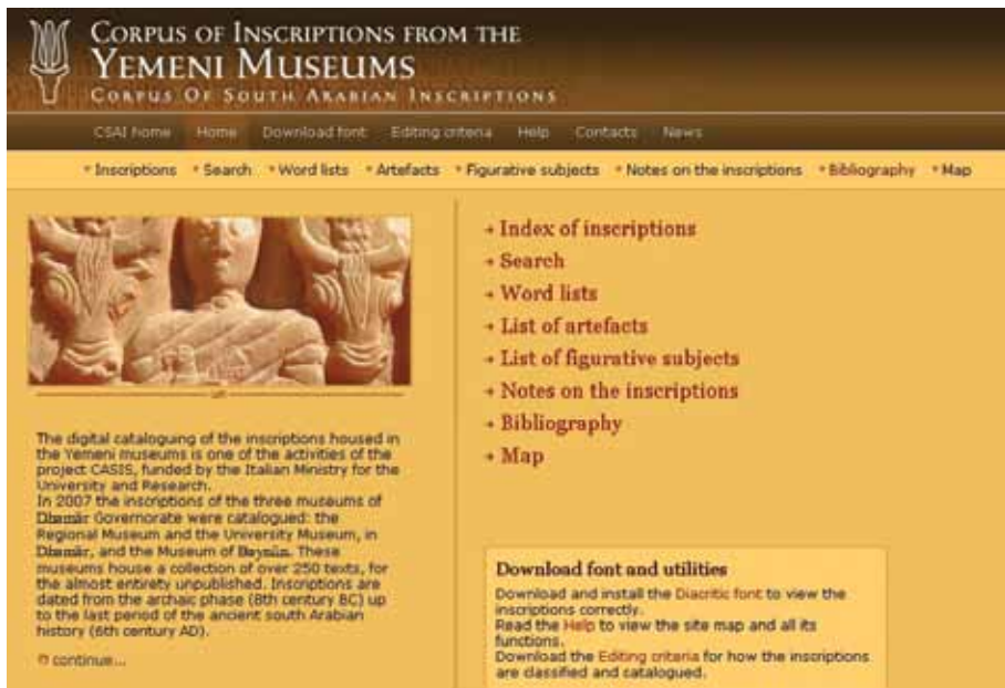
Fig. 28 - Home page of the Corpus of Inscriptions from the Yemeni Museums on CSAI ( http://csai.humnet.unipi.it )