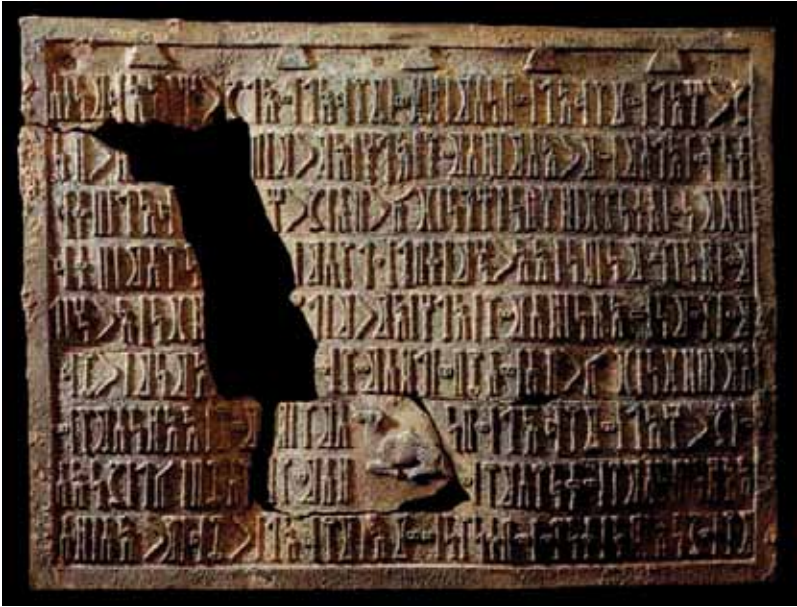
Fig. 17 - Bronze plaque with Qatabanic inscription