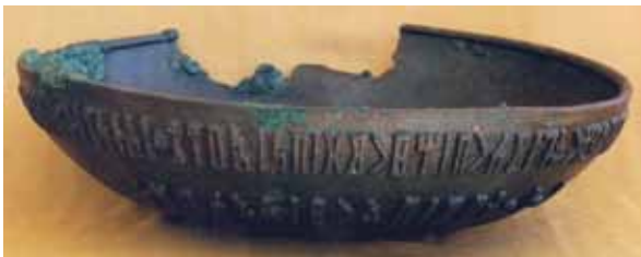
Fig. 11 Bronze inscribed bowl