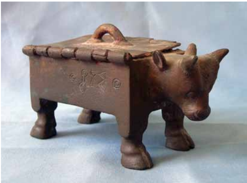
Fig. 18 - Bronze box in the shape of a bull from Awsan