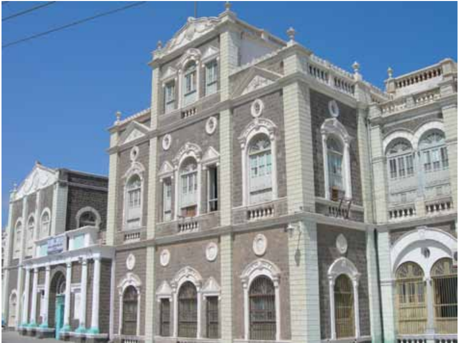
Fig. 1 - The National Museum of Aden

The National Museum of Aden is located in the wonderful colonial building of "Qasr al-Sultan", in the Crater. The tones of the sea blue are dominant on the exterior facades, on the capitals partially discoloured by the sun, and on the interior museum walls.