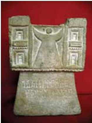
Fig. 13 Incense burner decorated with disc and false windows

There are some splendid, well known artefacts housed in the museum, especially coming from the kingdoms of Qataban, Awsan and Hadramawt: statues, alabaster stelae with figures in relief, incense burners, and also a collection of bronze objects, including plaques, statuettes, lamps and small vessels.