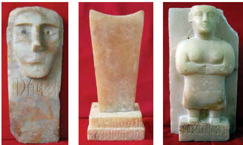
Figs. 23-25 - Examples of inscribed stelae in alabaster