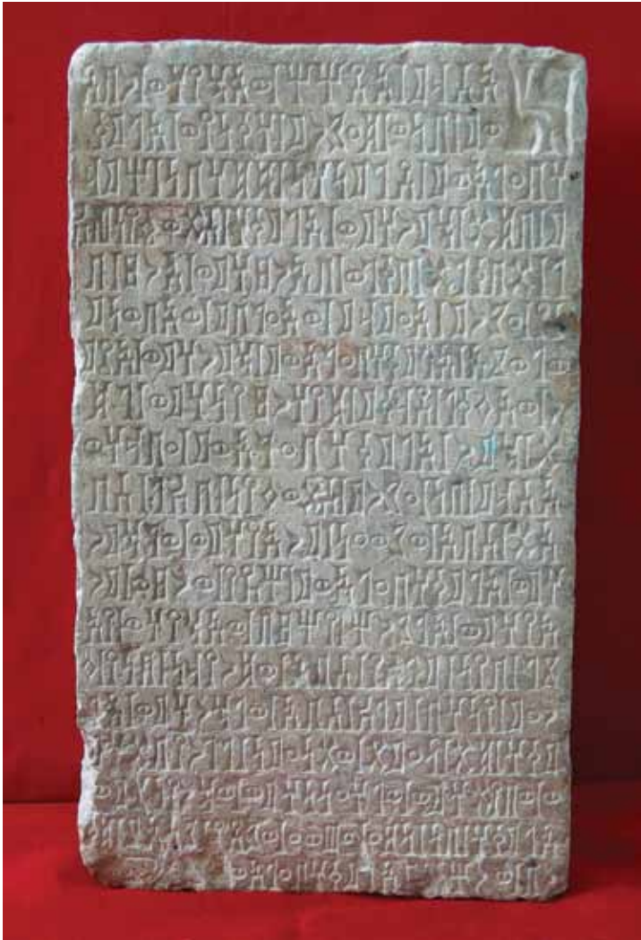
Fig. 19 - Sabaic inscription engraved on a statue base

The museum has also a great number of inscriptions on statue bases from the temple of Mahram Bilqis at Marib. These long, carefully engraved texts testify the devotion of the Sabaeans towards their God Almaqah.