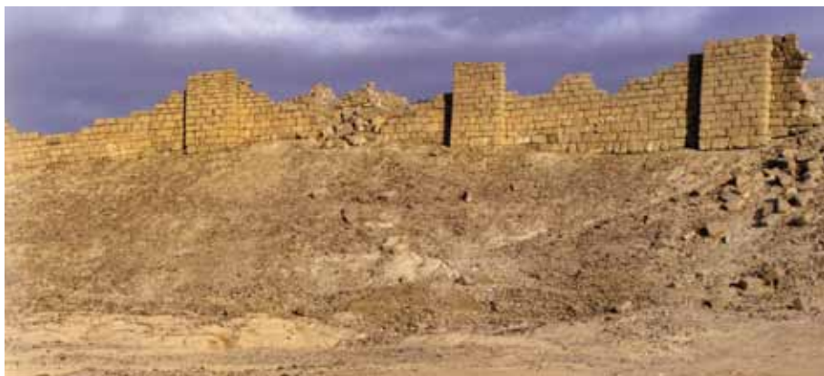
Fig. 7 - Baraqish (Main), city walls

Monumentality is the most striking feature of the South Arabian architecture. Cities were surrounded by impressive walls, houses and temples were built on high basements with courts, huge entrances, monolithic pillars and columns.