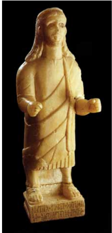
Figs. 20-21 - Statues of Awsanite kings. The second king wears a toga