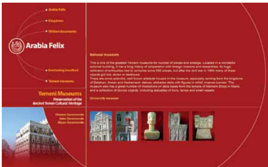
Fig. 27 - Home page of the Aden National Museum on Arabia Felix ( http://arabiafelix.humnet.unipi.it )