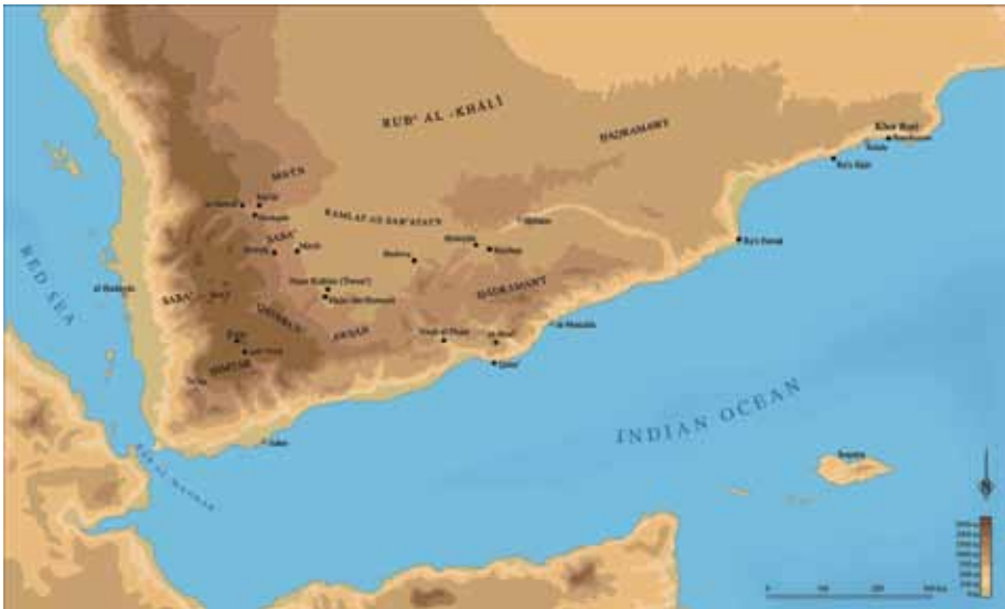
Fig. 5 - Map of ancient Yemen

Classical authors referred to the kingdoms of South Arabia as Arabia Felix, because it was the place of origin of incense and other precious substances.