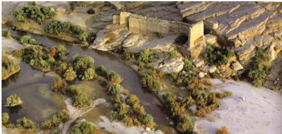
Fig. 6 - Marib (Saba), dam

Fertile oases could develop thanks to large stone dams built with a sophisticated technique, that oriented the floodwater coming with the abundant monsoon rains and channelled it straight to the fields.