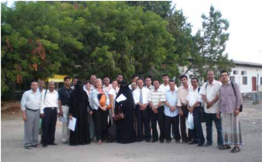
Fig. 29 - Participants and teachers of the training course, Aden University, 2008

Twenty students and researchers from different provinces of Yemen participated to the course. At the end, six of them were selected to work with CASIS in the museums of Aden.