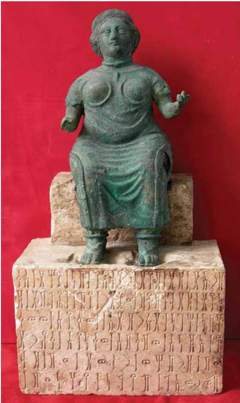
Fig. 16 - The Qatabanian statue of "Lady Barat"