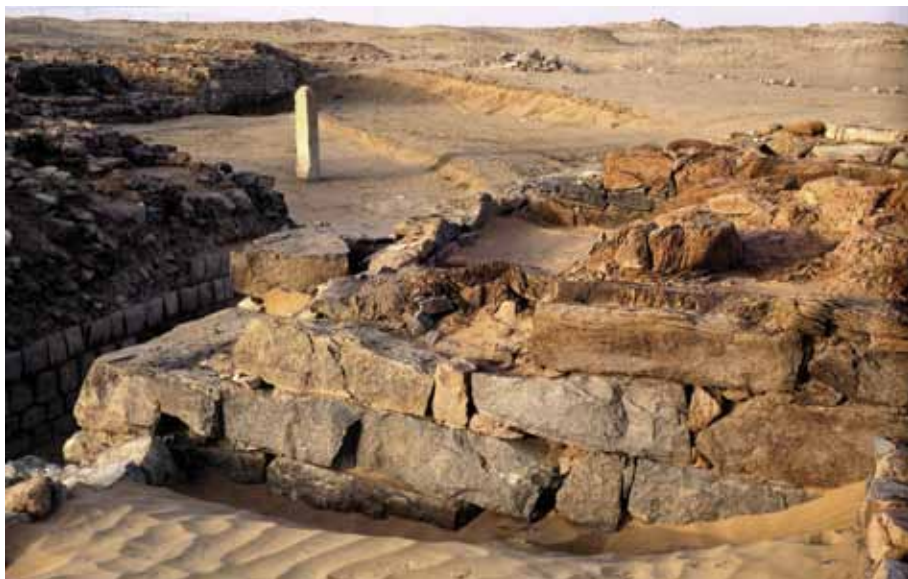
Fig. 8 - Timna (Qataban), market square