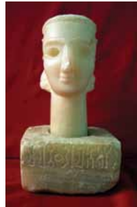
Fig. 15 Alabaster head on inscribed base