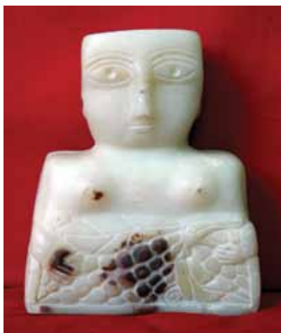
Fig. 31 Woman with bunch of grapes

In July 2009 a delegation of the project together with the Italian Ambassador in Yemen visited the National Museum and set up a computer laboratory for the museum staff.