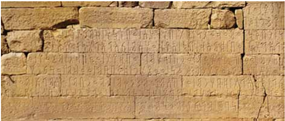
Fig. 10 - Inscription on city walls

There is also a minuscule writing on sticks attested from the early first millennium BC. Letters and private contracts were carved on sticks.